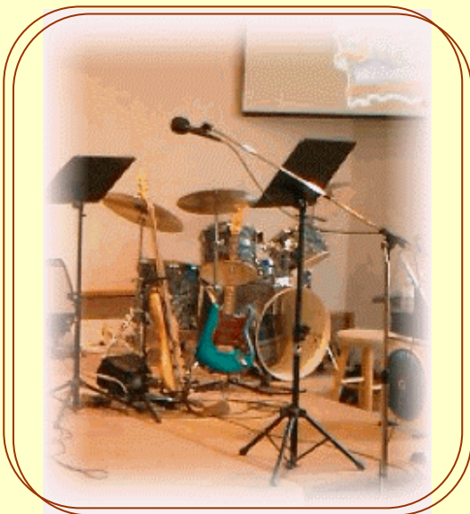
Ministry of Music